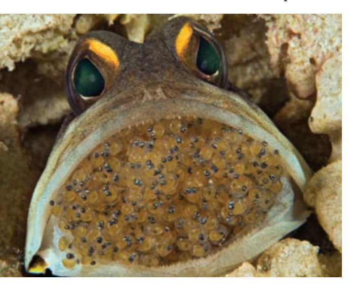
FIGURE 1.3 Reproductive strategies differ among species. The male gold-specs jawfish protects unhatched eggs by holding them in his mouth.

Need for energy All organisms need a source of energy for their life processes. Energy is the ability to cause a change or to do work. The form of energy used by all living things, from bacteria to ferrets to ferns, is chemical energy. Some organisms use chemicals from their environment to make their own source of chemical energy. Some organisms, such as plants, algae, and some bacteria, absorb energy from sunlight and store some of it in chemicals that can be used later as a source of energy. Animals get their source of energy by eating other organisms. In all organisms, energy is important for metabolism , or all of the chemical processes that build up or break down materials.