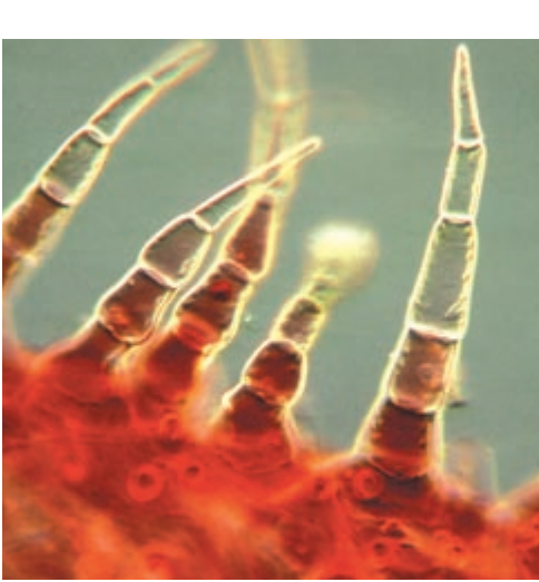
FIGURE 1.2 Cells can work together in specialized structures, such as these leaf hairs that protect a leaf from insects. (LM; magnification 700×)

Cells All organisms are made up of one or more cells. A cell is the basic unit of life. In fact, microscopic, single-celled organisms are the most common forms of life on Earth. A single-celled, or unicellular, organism carries out all of the functions of life, just as you do. Larger organisms that you see every day are made of many cells, and are called multicellular organisms. Different types of cells in a multicellular organism have specialized functions, as shown in FIGURE 1.2. Your muscle cells contract and relax, your stomach cells secrete digestive juices, and your brain cells interpret sensory information. Together, specialized cells make you a complete organism.