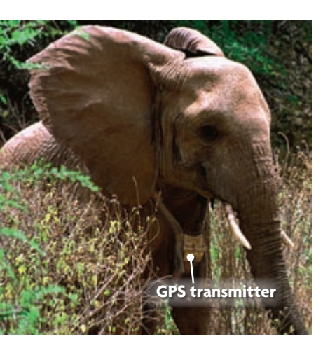
FIGURE 1.4 Ecologists use data transmitted by GPS receivers worn by elephants to develop computer models of the animals' movements.