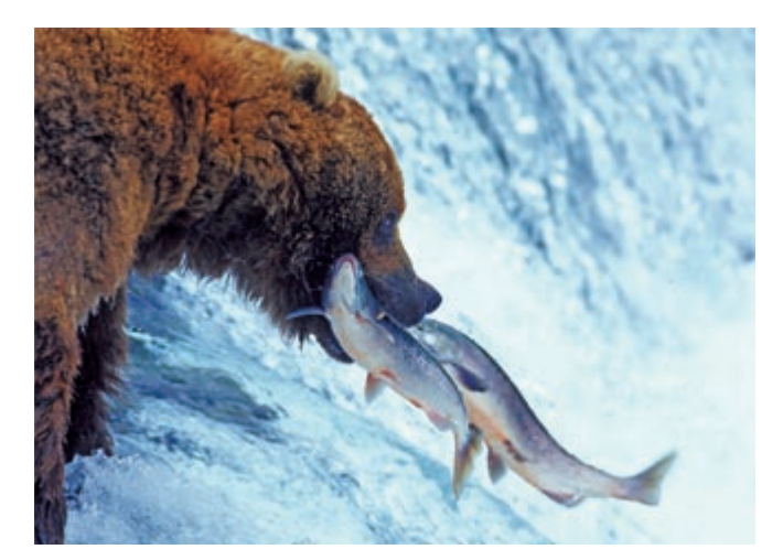
FIGURE 1.1 Salmon are a primary food source for many species, including grizzly bears. If salmon disappeared, species dependent on them would also suffer.

Over their life cycle, Pacific salmon are the main food source for more than 140 species of wildlife, including grizzly bears, as shown in FIGURE 1.1 . If they are not eaten, their bodies return vital nutrients back into the river system, some of which are used by plants to grow. In addition to their role in the health of river systems, salmon are also important to the Pacific Northwest's economy. Today, many species of wild Pacific salmon are threatened with extinction due to competition from hatchery fish, blocked river paths, and loss of spawning grounds. As salmon populations decline, how are other species affected? What effect would the loss of salmon have on a local and a global scale? These are the types of questions ecologists are trying to answer.