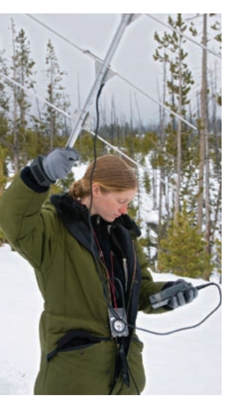
FIGURE 1.3 Much of the data gathered by ecologists results from long hours of observation in the field. This ecologist is using radio telemetry to track gray wolves.

Apply How might a scientist use observation to study a population of mountain goats? Explain your answer.