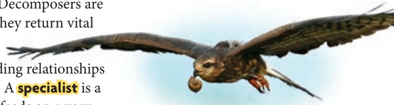
FIGURE 4.2 Florida snail kites are specialists that rely on apple snails as their primary food source.